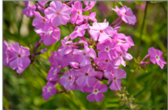
Opening Act Romance Phlox flowers

Opening Act Romance Phlox is recommended for the following landscape applications;