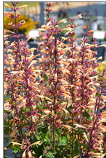
Meant To Bee Queen Nectarine Anise Hyssop flowers

Meant To Bee Queen Nectarine Anise Hyssop is an open herbaceous perennial with an upright spreading habit of growth. Its relatively fine texture sets it apart from other garden plants with less refined foliage.