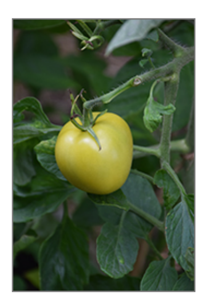
Old German Tomato fruit