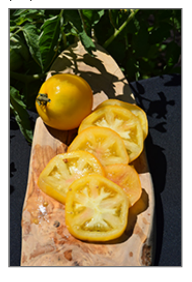
Old German Tomato fruit and flesh