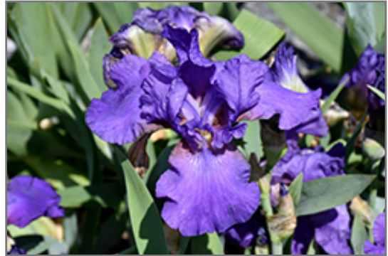
His Royal Highness Bearded Iris flowers