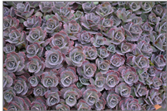
Sunsparkler Blue Pearl Stonecrop foliage

Sunsparkler Blue Pearl Stonecrop is recommended for the following landscape applications;