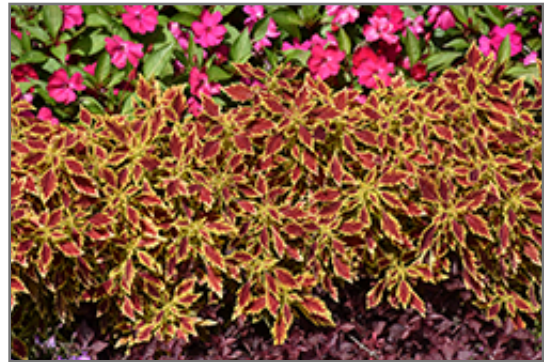
FlameThrower Serrano Coleus

We are so proud of the nursery stock that we have carefully selected for superior quality and performance, WE GUARANTEE ALL TREES, SHRUBS, EVERGREENS FOR 2 YEARS, AND ROSES FOR 1 YEAR!