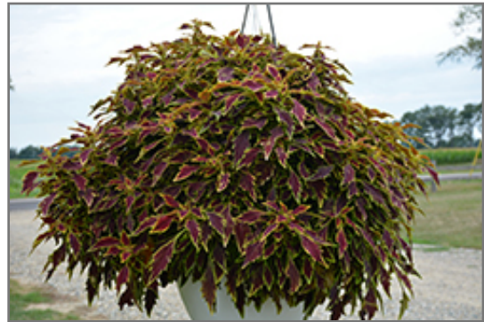
FlameThrower Serrano Coleus