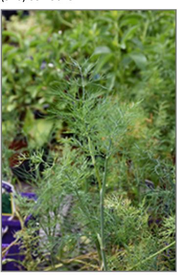
Bouquet Dill foliage

Bouquet Dill will grow to be about 3 feet tall at maturity, with a spread of 12 inches. Its foliage tends to remain dense right to the ground, not requiring facer plants in front. This fast-growing annual will normally live for one full growing season, needing replacement the following year. However, this species tends to self-seed and may thereby endure for years in the garden if allowed.