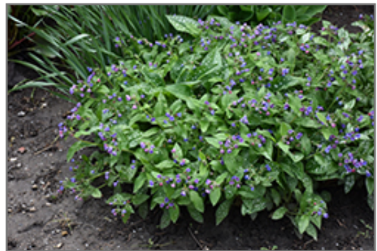
Dark Vader Lungwort in bloom

We are so proud of the nursery stock that we have carefully selected for superior quality and performance, WE GUARANTEE ALL TREES, SHRUBS, EVERGREENS FOR 2 YEARS, AND ROSES FOR 1 YEAR!