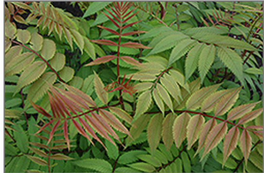
Sem False Spirea foliage

Sem False Spirea is a multi-stemmed deciduous shrub with a more or less rounded form. Its average texture blends into the landscape, but can be balanced by one or two finer or coarser trees or shrubs for an effective composition.