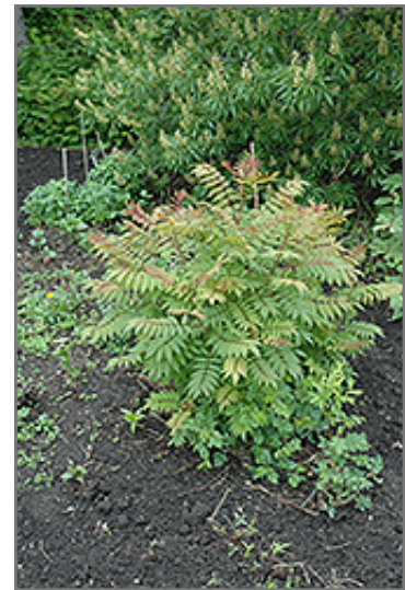
Sem False Spirea

We are so proud of the nursery stock that we have carefully selected for superior quality and performance, WE GUARANTEE ALL TREES, SHRUBS, EVERGREENS FOR 2 YEARS, AND ROSES FOR 1 YEAR!