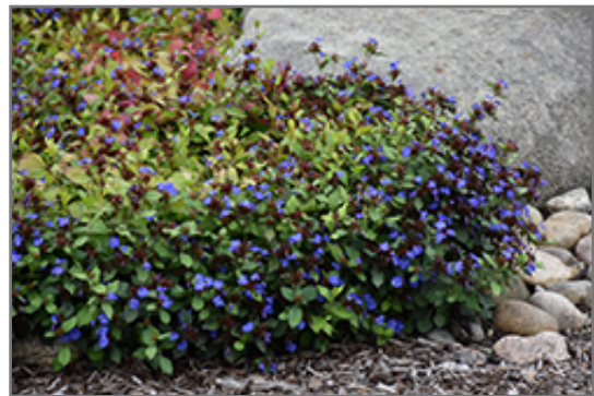
Plumbago in bloom

We are so proud of the nursery stock that we have carefully selected for superior quality and performance, WE GUARANTEE ALL TREES, SHRUBS, EVERGREENS FOR 2 YEARS, AND ROSES FOR 1 YEAR!