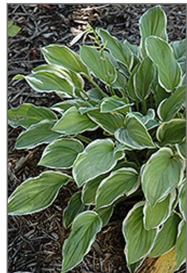
So Sweet Hosta foliage

We are so proud of the nursery stock that we have carefully selected for superior quality and performance, WE GUARANTEE ALL TREES, SHRUBS, EVERGREENS FOR 2 YEARS, AND ROSES FOR 1 YEAR!