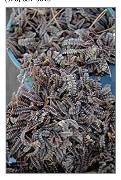
Platt's Black Brass Buttons

This is a cultivar in which the unusual nearly black foliage is the real attraction; delicate fern-like leaves will tolerate some foot traffic; neither flowers or fruit are particularly ornamental; great as a color accent in a rock garden