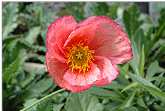
Champagne Bubbles Poppy flowers