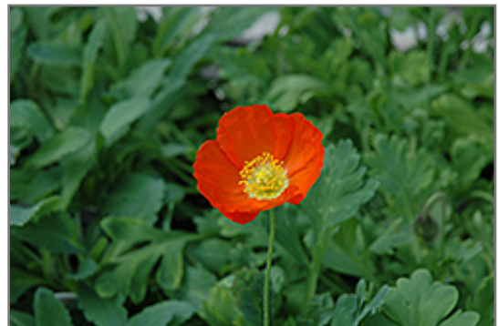
Champagne Bubbles Poppy flowers

We are so proud of the nursery stock that we have carefully selected for superior quality and performance, WE GUARANTEE ALL TREES, SHRUBS, EVERGREENS FOR 2 YEARS, AND ROSES FOR 1 YEAR!