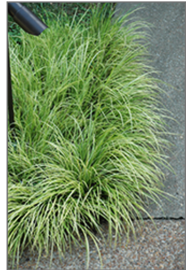
Grassy-Leaved Sweet Flag

Grassy-Leaved Sweet Flag is a fine choice for the garden, but it is also a good selection for planting in outdoor pots and containers. It is often used as a 'filler' in the 'spiller-thriller-filler' container combination, providing a canvas of foliage against which the larger thriller plants stand out. Note that when growing plants in outdoor containers and baskets, they may require more frequent waterings than they would in the yard or garden. Be aware that in our climate, most plants cannot be expected to survive the winter if left in containers outdoors, and this plant is no exception. Contact our experts for more information on how to protect it over the winter months.