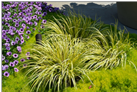
Grassy-Leaved Sweet Flag

This is a relatively low maintenance plant, and is best cleaned up in early spring before it resumes active growth for the season. It has no significant negative characteristics.