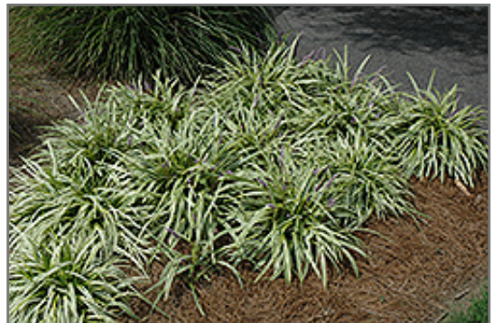
Variegata Lily Turf in bloom

We are so proud of the nursery stock that we have carefully selected for superior quality and performance, WE GUARANTEE ALL TREES, SHRUBS, EVERGREENS FOR 2 YEARS, AND ROSES FOR 1 YEAR!