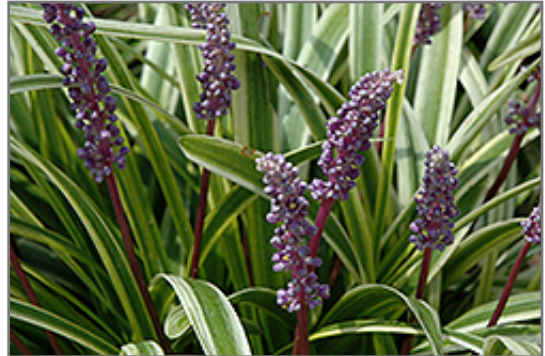
Variegata Lily Turf flowers

Variegata Lily Turf is a dense herbaceous perennial with a ground-hugging habit of growth. Its medium texture blends into the garden, but can always be balanced by a couple of finer or coarser plants for an effective composition.