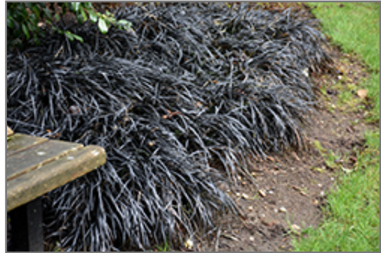
Black Mondo Grass

Black Mondo Grass is recommended for the following landscape applications;