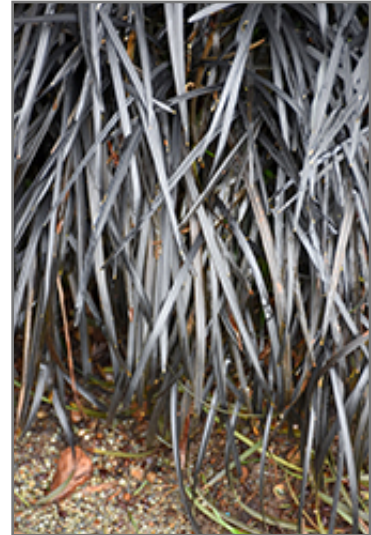
Black Mondo Grass foliage

Black Mondo Grass is a fine choice for the garden, but it is also a good selection for planting in outdoor pots and containers. It is often used as a 'filler' in the 'spiller-thriller-filler' container combination, providing a mass of flowers and foliage against which the thriller plants stand out. Note that when growing plants in outdoor containers and baskets, they may require more frequent waterings than they would in the yard or garden. Be aware that in our climate, most plants cannot be expected to survive the winter if left in containers outdoors, and this plant is no exception. Contact our experts for more information on how to protect it over the winter months.