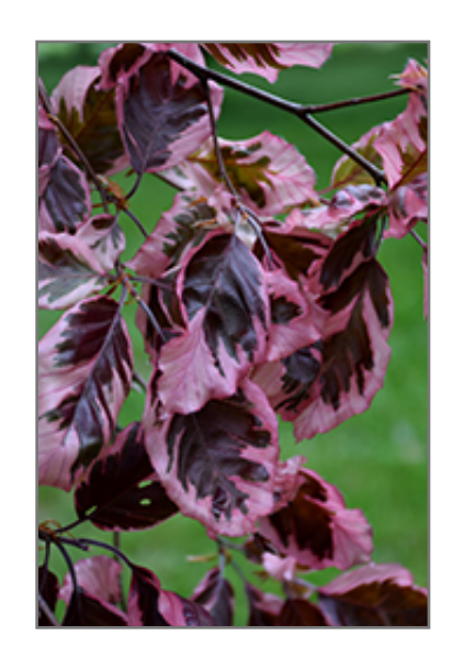
Tricolor Beech foliage