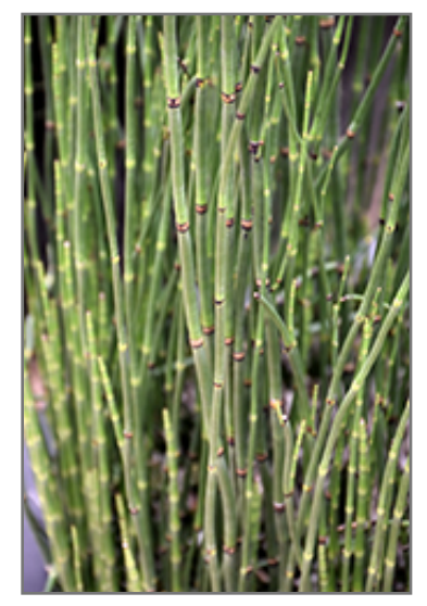
Horsetail foliage