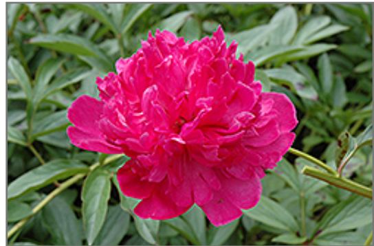
Felix Crousse Peony flowers

We are so proud of the nursery stock that we have carefully selected for superior quality and performance, WE GUARANTEE ALL TREES, SHRUBS, EVERGREENS FOR 2 YEARS, AND ROSES FOR 1 YEAR!