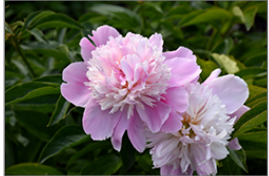
Monsieur Jules Elie Peony flowers

We are so proud of the nursery stock that we have carefully selected for superior quality and performance, WE GUARANTEE ALL TREES, SHRUBS, EVERGREENS FOR 2 YEARS, AND ROSES FOR 1 YEAR!