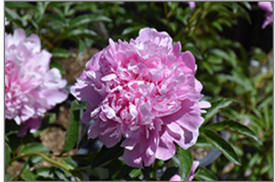
Monsieur Jules Elie Peony flowers