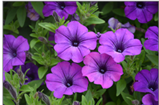
Supertunia Indigo Charm Petunia flowers

Supertunia Indigo Charm Petunia is recommended for the following landscape applications;