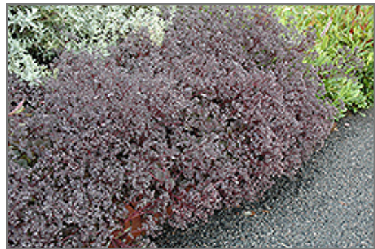
Bertram Anderson Stonecrop

We are so proud of the nursery stock that we have carefully selected for superior quality and performance, WE GUARANTEE ALL TREES, SHRUBS, EVERGREENS FOR 2 YEARS, AND ROSES FOR 1 YEAR!