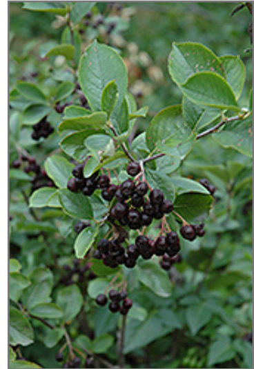
Black Chokeberry fruit

Black Chokeberry is recommended for the following landscape applications;