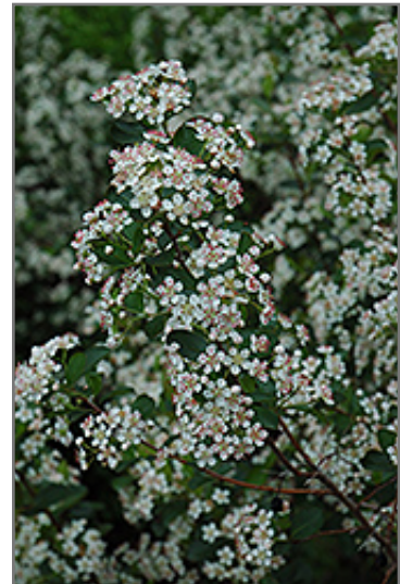
Black Chokeberry flowers

We are so proud of the nursery stock that we have carefully selected for superior quality and performance, WE GUARANTEE ALL TREES, SHRUBS, EVERGREENS FOR 2 YEARS, AND ROSES FOR 1 YEAR!