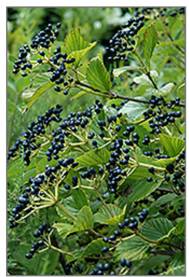
Arrowwood fruit

Big Bend S71 W23445 National (262) 662-5800