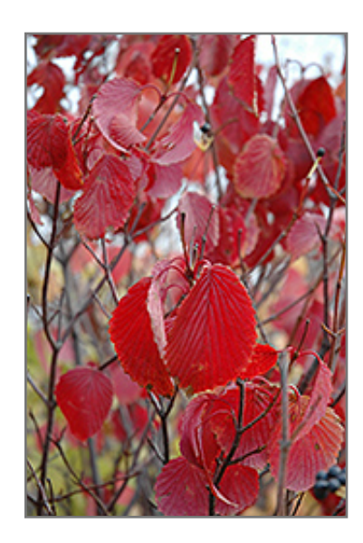
Arrowwood in fall

We are so proud of the nursery stock that we have carefully selected for superior quality and performance, WE GUARANTEE ALL TREES, SHRUBS, EVERGREENS FOR 2 YEARS, AND ROSES FOR 1 YEAR!