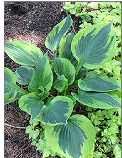
Twilight Hosta

We are so proud of the nursery stock that we have carefully selected for superior quality and performance, WE GUARANTEE ALL TREES, SHRUBS, EVERGREENS FOR 2 YEARS, AND ROSES FOR 1 YEAR!