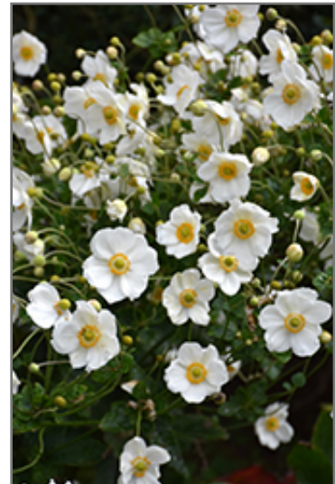
Honorine Jobert Anemone flowers

Honorine Jobert Anemone is recommended for the following landscape applications;