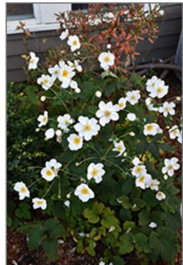
Honorine Jobert Anemone in bloom

We are so proud of the nursery stock that we have carefully selected for superior quality and performance, WE GUARANTEE ALL TREES, SHRUBS, EVERGREENS FOR 2 YEARS, AND ROSES FOR 1 YEAR!