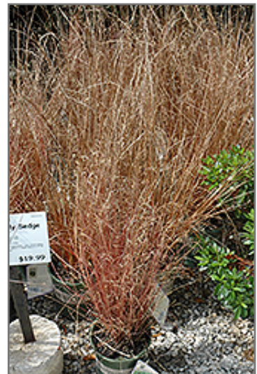
Leatherleaf Sedge

We are so proud of the nursery stock that we have carefully selected for superior quality and performance, WE GUARANTEE ALL TREES, SHRUBS, EVERGREENS FOR 2 YEARS, AND ROSES FOR 1 YEAR!