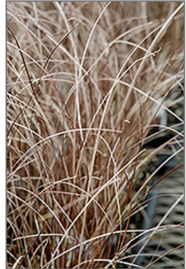
Leatherleaf Sedge foliage

Leatherleaf Sedge is recommended for the following landscape applications;