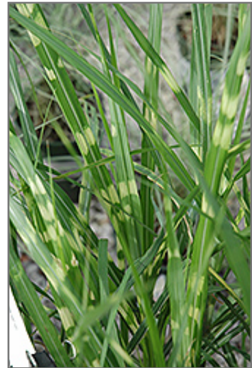
Porcupine Grass foliage

Porcupine Grass features bold plumes of rose flowers rising above the foliage in late summer. Its attractive grassy leaves are bluish-green in color with showy gold variegation. The foliage often turns yellow in fall. The silver seed heads are carried on showy plumes displayed in abundance from early fall to late winter. The brick red stems are very colorful and add to the overall interest of the plant.