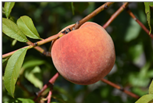
Redhaven Peach fruit