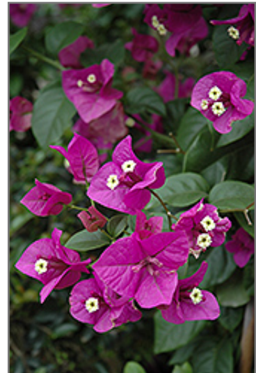
Purple Queen Bougainvillea flowers