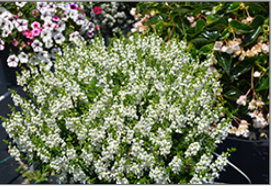
Serenita White Angelonia flowers