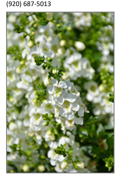
Serenita White Angelonia flowers

Serenita White Angelonia is an herbaceous annual with an upright spreading habit of growth. Its relatively fine texture sets it apart from other garden plants with less refined foliage.