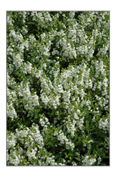
Serenita White Angelonia flowers