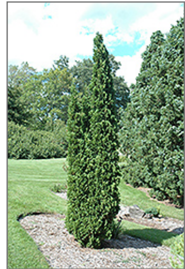
Degroot's Spire Arborvitae

We are so proud of the nursery stock that we have carefully selected for superior quality and performance, WE GUARANTEE ALL TREES, SHRUBS, EVERGREENS FOR 2 YEARS, AND ROSES FOR 1 YEAR!