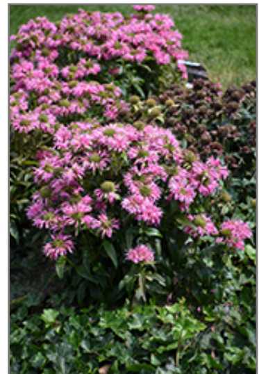
Pardon My Pink Beebalm in bloom

We are so proud of the nursery stock that we have carefully selected for superior quality and performance, WE GUARANTEE ALL TREES, SHRUBS, EVERGREENS FOR 2 YEARS, AND ROSES FOR 1 YEAR!