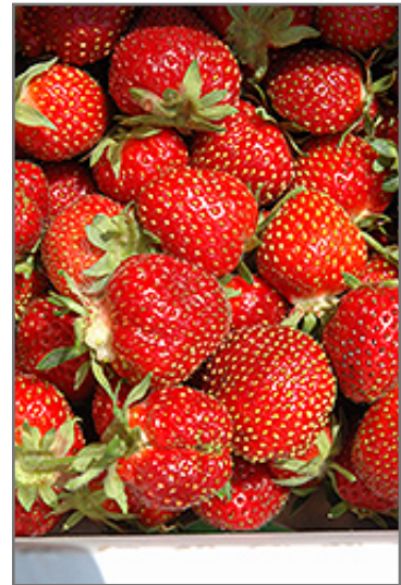
Tristar Strawberry fruit

Tristar Strawberry features dainty white cup-shaped flowers with lemon yellow eyes along the stems from mid spring to early fall. Its serrated round compound leaves remain dark green in color throughout the season. It features an abundance of magnificent red berries from late spring to mid fall.