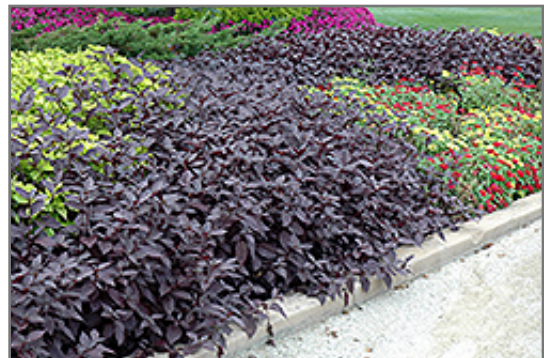
Purple Knight Alternanthera

We are so proud of the nursery stock that we have carefully selected for superior quality and performance, WE GUARANTEE ALL TREES, SHRUBS, EVERGREENS FOR 2 YEARS, AND ROSES FOR 1 YEAR!