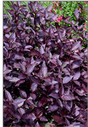
Purple Knight Alternanthera foliage

Purple Knight Alternanthera is recommended for the following landscape applications;