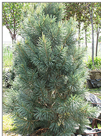
Vanderwolf's Pyramid Pine