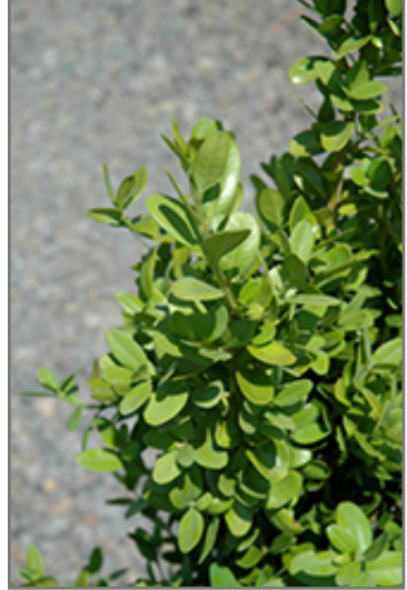
Green Tower Boxwood foliage