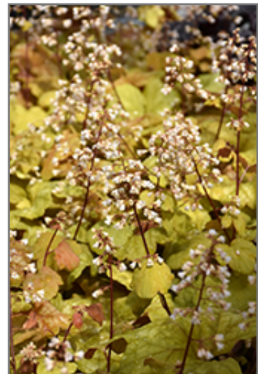
Champagne Coral Bells flowers

We are so proud of the nursery stock that we have carefully selected for superior quality and performance, WE GUARANTEE ALL TREES, SHRUBS, EVERGREENS FOR 2 YEARS, AND ROSES FOR 1 YEAR!