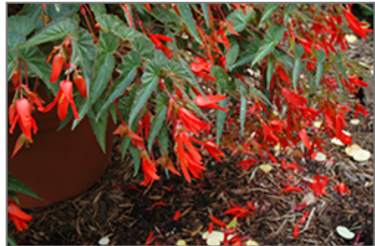
Santa Cruz Begonia flowers

Santa Cruz Begonia is recommended for the following landscape applications;