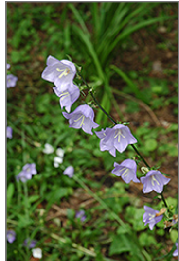
Bluebells Of Scotland flowers

Bluebells Of Scotland is recommended for the following landscape applications;