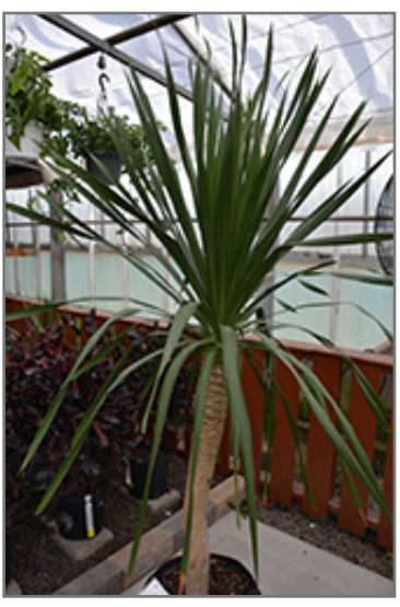
Dragon Tree

Dragon Tree's attractive narrow leaves emerge light green, turning bluish-green in color throughout the year on a plant with an upright spreading habit of growth. The tan stems can be quite attractive and add to the plant's interest.