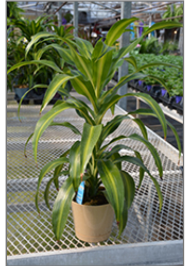
Hawaiian Sunshine Dracaena

When grown indoors, Hawaiian Sunshine Dracaena can be expected to grow to be about 5 feet tall at maturity, with a spread of 30 inches. It grows at a medium rate, and under ideal conditions can be expected to live for approximately 10 years. This houseplant performs well in both bright or indirect sunlight and strong artificial light, and can therefore be situated in almost any well-lit room or location. It does best in average to evenly moist soil, but will not tolerate standing water. The surface of the soil shouldn't be allowed to dry out completely, and so you should expect to water this plant once and possibly even twice each week. Be aware that your particular watering schedule may vary depending on its location in the room, the pot size, plant size and other conditions; if in doubt, ask one of our experts in the store for advice. It is not particular as to soil type or pH; an average potting soil should work just fine.