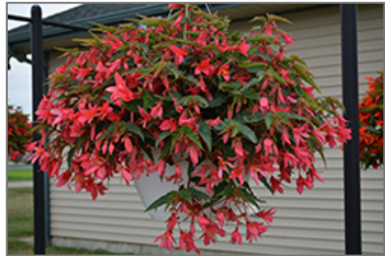
Bossa Nova Pink Glow Begonia in bloom