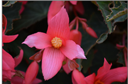
Bossa Nova Pink Glow Begonia flowers

Bossa Nova Pink Glow Begonia is an herbaceous annual with a trailing habit of growth, eventually spilling over the edges of hanging baskets and containers. Its medium texture blends into the garden, but can always be balanced by a couple of finer or coarser plants for an effective composition.