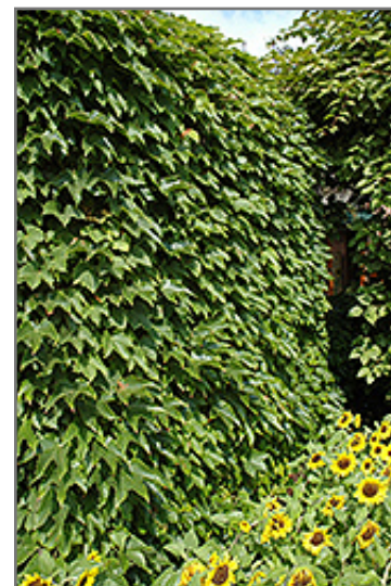
Boston Ivy

We are so proud of the nursery stock that we have carefully selected for superior quality and performance, WE GUARANTEE ALL TREES, SHRUBS, EVERGREENS FOR 2 YEARS, AND ROSES FOR 1 YEAR!