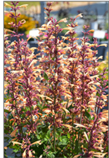
Meant To Bee Queen Nectarine Anise Hyssop flowers

Meant To Bee Queen Nectarine Anise Hyssop is an open herbaceous perennial with an upright spreading habit of growth. Its relatively fine texture sets it apart from other garden plants with less refined foliage.