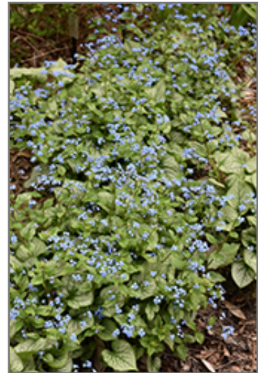
Jack Frost Bugloss in bloom

Jack Frost Bugloss is a fine choice for the garden, but it is also a good selection for planting in outdoor pots and containers. It is often used as a 'filler' in the 'spiller-thriller-filler' container combination, providing a mass of flowers and foliage against which the thriller plants stand out. Note that when growing plants in outdoor containers and baskets, they may require more frequent waterings than they would in the yard or garden. Be aware that in our climate, most plants cannot be expected to survive the winter if left in containers outdoors, and this plant is no exception. Contact our experts for more information on how to protect it over the winter months.