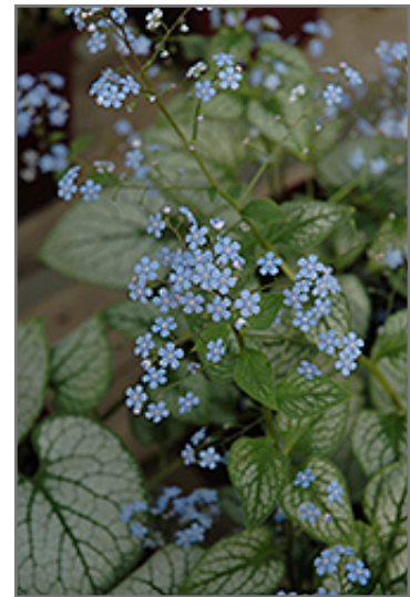
Jack Frost Bugloss flowers

We are so proud of the nursery stock that we have carefully selected for superior quality and performance, WE GUARANTEE ALL TREES, SHRUBS, EVERGREENS FOR 2 YEARS, AND ROSES FOR 1 YEAR!