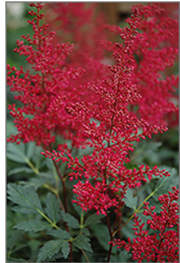
Red Sentinel Astilbe flowers

This is a relatively low maintenance plant, and is best cleaned up in early spring before it resumes active growth for the season. It is a good choice for attracting butterflies to your yard, but is not particularly attractive to deer who tend to leave it alone in favor of tastier treats. It has no significant negative characteristics.