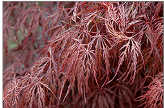
Crimson Queen Japanese Maple foliage

This is a relatively low maintenance shrub, and should only be pruned in summer after the leaves have fully developed, as it may 'bleed' sap if pruned in late winter or early spring. It has no significant negative characteristics.