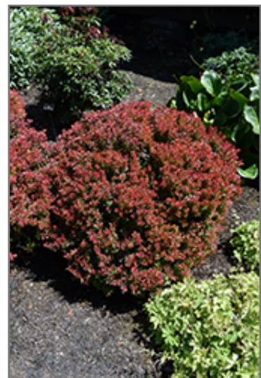
Golden Ruby Barberry

We are so proud of the nursery stock that we have carefully selected for superior quality and performance, WE GUARANTEE ALL TREES, SHRUBS, EVERGREENS FOR 2 YEARS, AND ROSES FOR 1 YEAR!