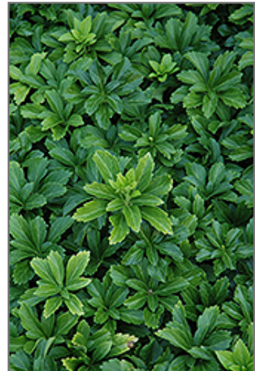
Green Sheen Japanese Spurge foliage

Green Sheen Japanese Spurge is recommended for the following landscape applications;